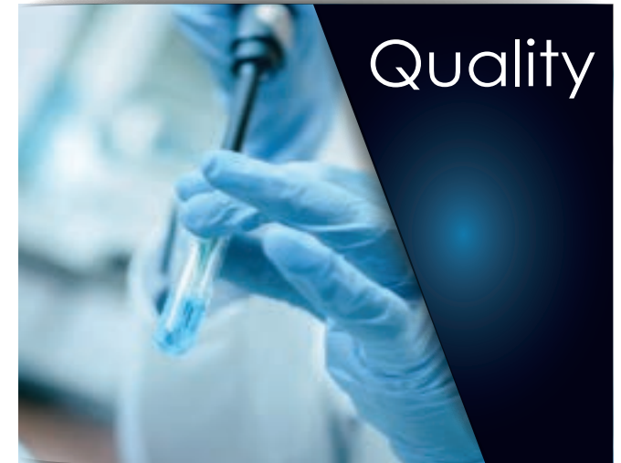
Quality Lab c/o CSI (Bollate - MI)