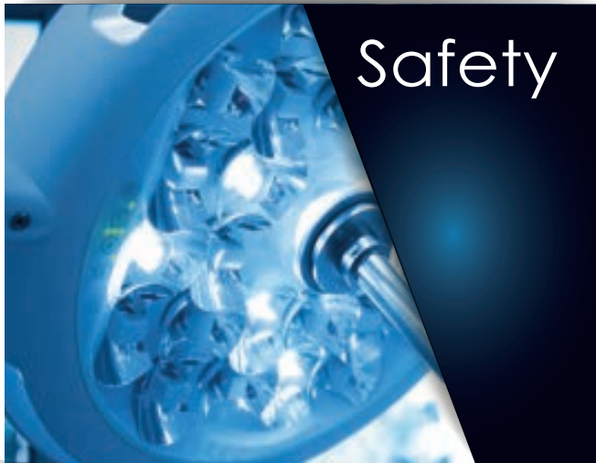
IMQ Safety Lab (Milan) (ACCREDIA - CBTL)